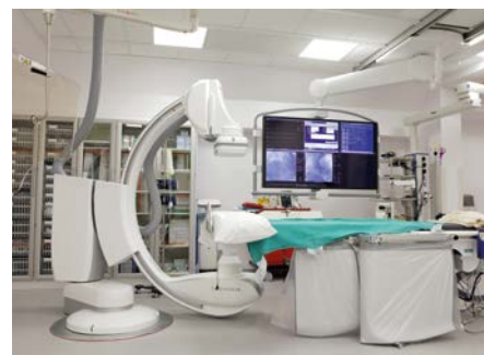
Artis Q for Interventional Cardiology

For further information on our Cardiac Procedures contact our Customer Services Department on 01202 702830 .